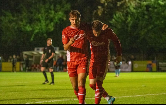
30 April LEAGUE v Bowers & Pitsea DREW 2-2