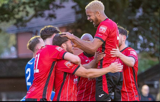
20 Aug LEAGUE v Bury Town WON 4-0