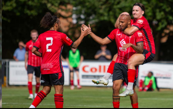
26 Aug LEAGUE v Bury Town WON 3-1