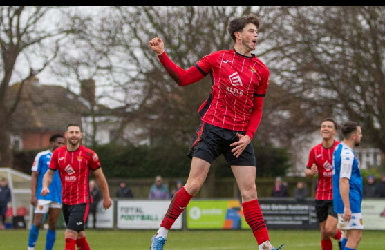
26 Dec LEAGUE v Ipswich Wanderers WON 1-0