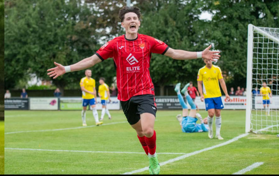
10 Aug LEAGUE v Newmarket Town WON 6-1