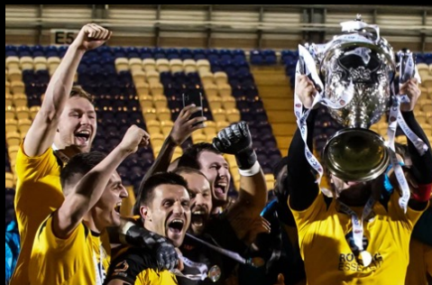
Rocks lift the Essex Senior Cup for the first time after beating Chelmsford City 3-1 at Colchester in April 2019.

Things looked bleak for the club's future for a while, as most of the off-field management and